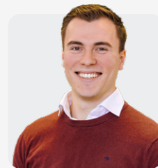
Brent Laboratory technician

We work every day to create sustainable solutions that will shape tomorrow's world.